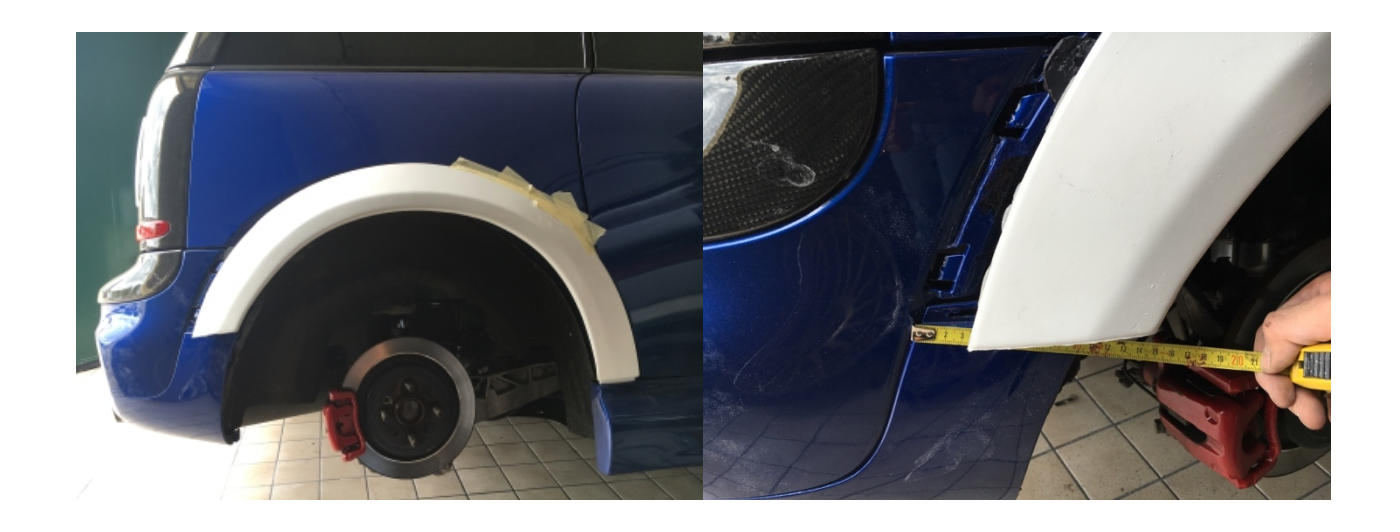
THERE'S A GOOD 3 CMS TO GAIN IN WIDTH BUT NO WORRIES: