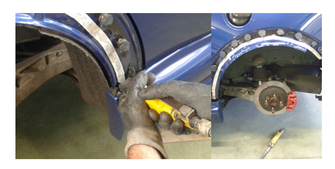
DON'T FORGET TO SEAL THE CUT METAL WITH SOME SEALER OR PROTECTING PAINT TO AVOID RUST UNDER THERE.