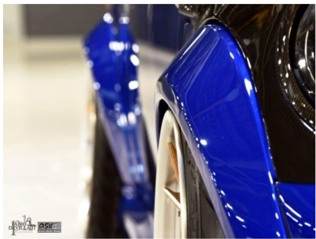
THANK YOU FOR HAVING CHOSEN OUR PRODUCTS!